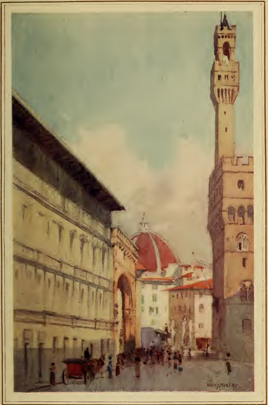
THE LOGGIA DE' LANZI, THE DUOMO, AND THE PALAZZO VECCHIO FROM THE PORTICO OF THE UFFIZI